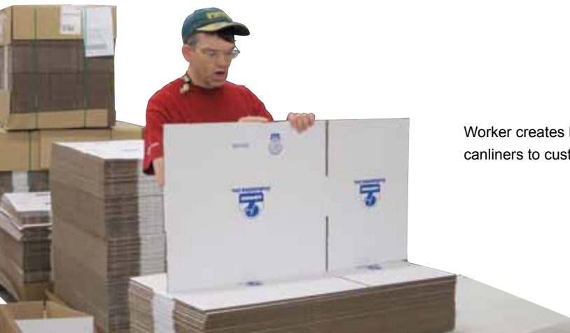
Worker creates boxes for shipping canliners to customers.