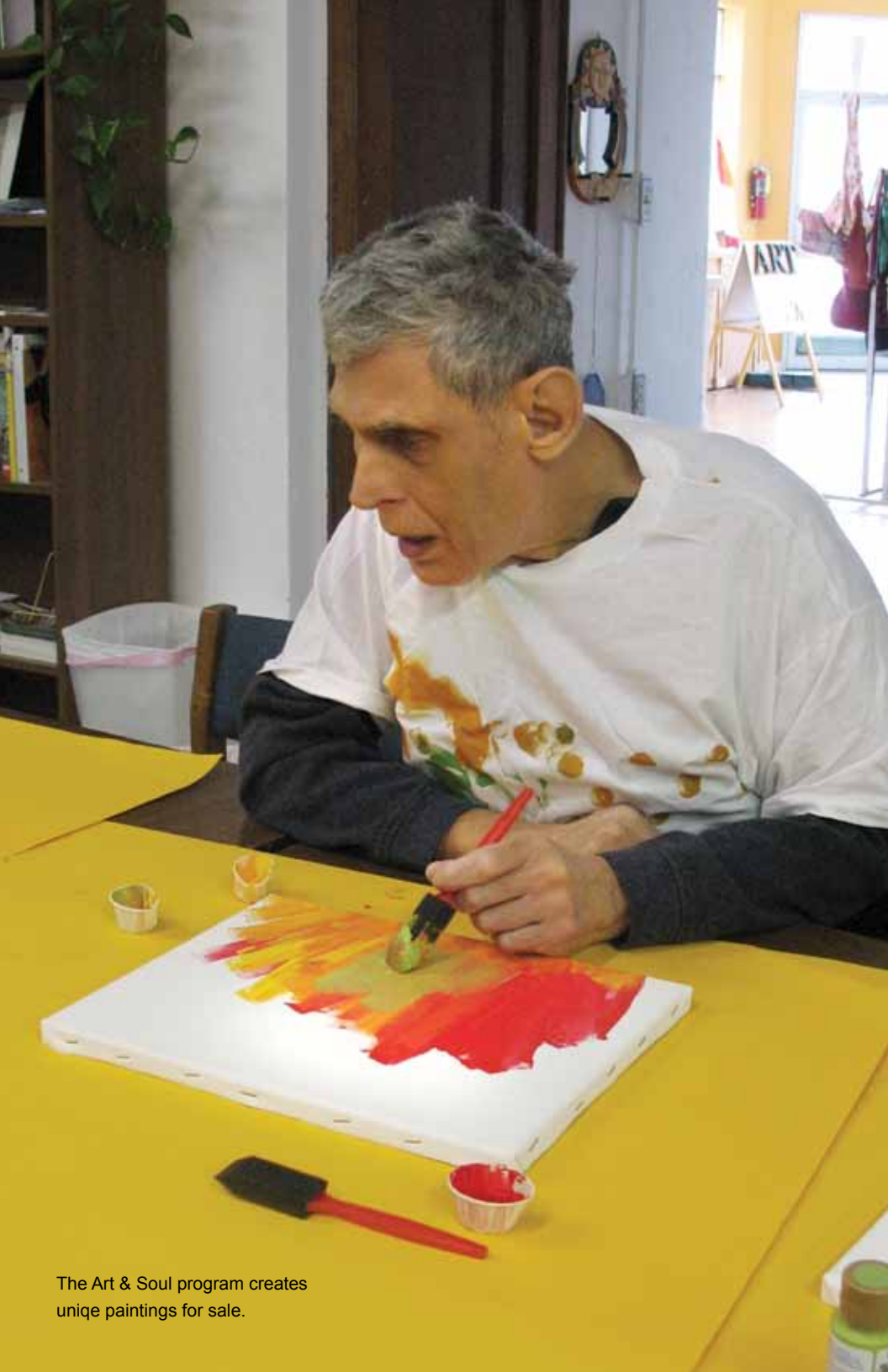
The Art & Soul program creates unique paintings for sale.